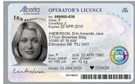
Canadian Driver License or ID Card