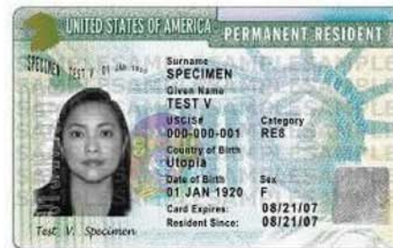
Permanent Resident Card