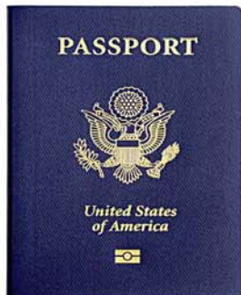
Passport or Passport ID Card