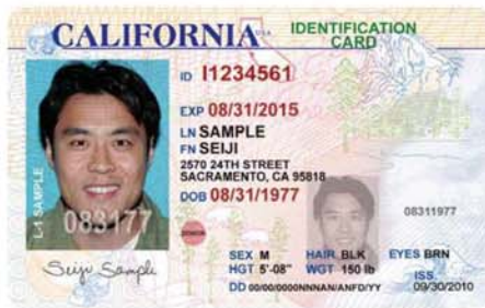
Driver License or ID Card any State