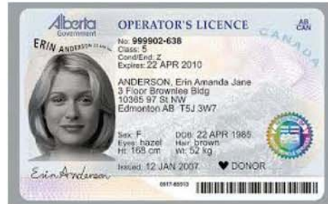
Canadian Driver License or ID Card