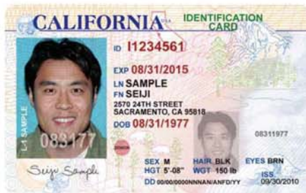
Driver License or ID Card any State